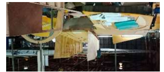
Sections of the Airspeed Oxford fuselage: Photographs by Paul Rourke.