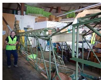
Volunteers working on the Avro Anson