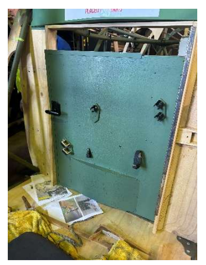
Anson door providing access to the turret, ready for installation

Further progress has been made on the fuselage, engine and undercarriage components and the nose cone. For example, window frames and windows have been installed; the nose cone and forward cone have been mated together – with a lot of riveting required!; and engine framework and undercarriage components have been stripped, cleaned and media blasted to be ready for reinstallation on port and starboard undercarriage and engine frames; some internal timber fittings have been manufactured; and the final colour scheme for the project has been ratified by the Committee.