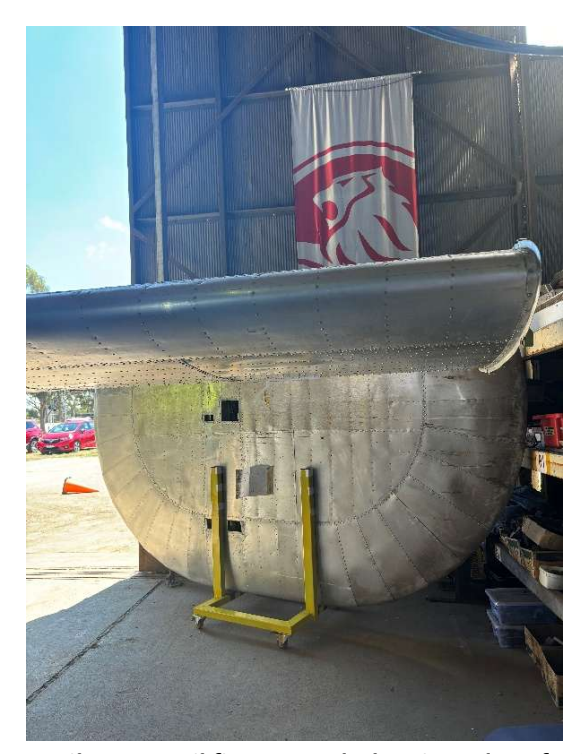
B-24 Liberator tail fin on stand, showing edge of tail plane from which it was removed

rotating engines to ensure efficiency and appropriate storage of engines when they are not being run.