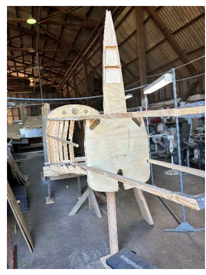
Airspeed Oxford stern post

The team has been working on the roof for the fuselage and on positioning the stern post at the rear end of the fuselage.