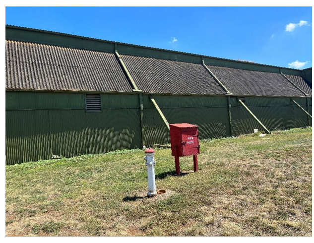
The far side of our restoration hangar after the area was cleared, the wall cleaned and repainted

Hangar equipment that has been used for a long time has been assessed and we shall be purchasing replacements for the cut-off saw and the vacuum cleaner with cyclone attachment for the sand blaster.