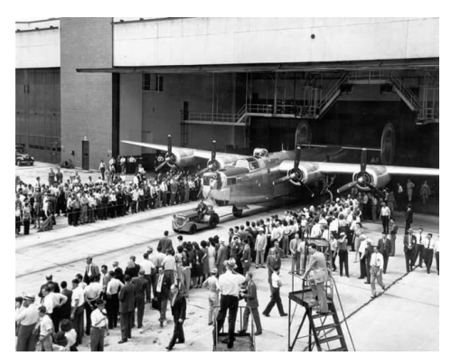
Last liberator built out of a total of 18,000 Willow Run, June 1945