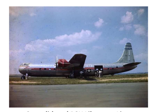
Consolidated R2Y Liberator Liner One was built but no military service eventuated. It served briefly as a freighter.